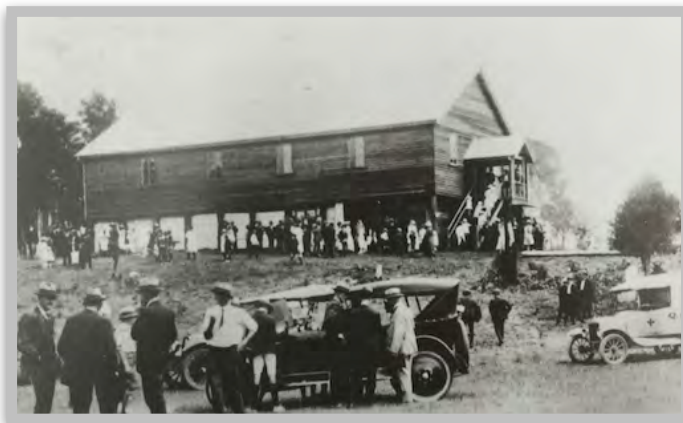
The photo above shows the 1924 show which was opened by the Governor of Queensland. Notice the show pavilion. It was in use until well into the 1980's.

For more details either about the show or times for intermittent bus stops to Maleny visit their Facebook Page or ring the Maleny Show Society on 5494 2008.