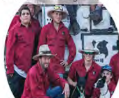
Backtrack BOYS and their dogs